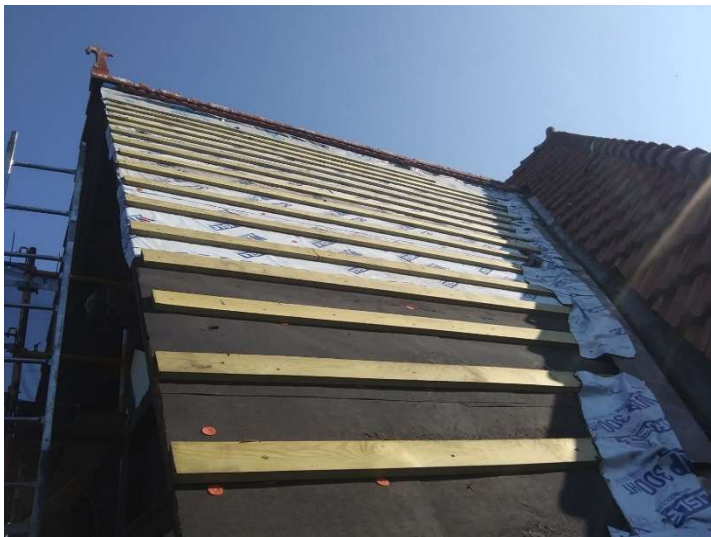
SOUTH FACE LOOKING UP RAKE