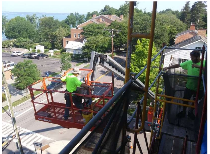
LOADING TILE ON SCAFFOLDING