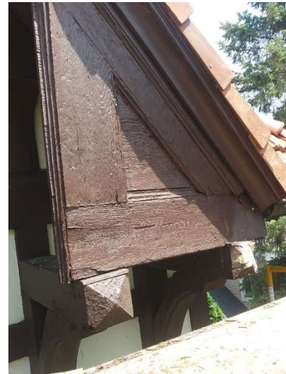
SOUTH FACE FACIA END - FINISHED