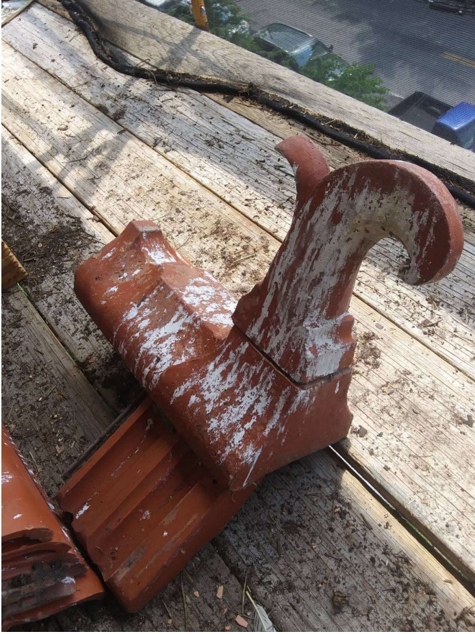
EXISTING RIDGE FINIAL