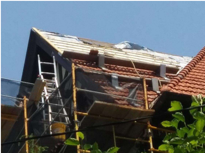
SOUTH FACE LOOKING UP RAKE