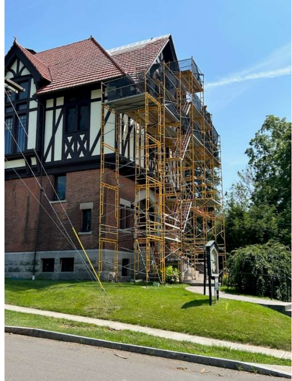
CHERRY AVE – NORTH FACE