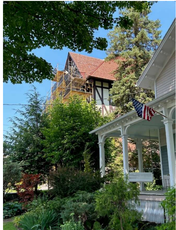
SOUTH FACE – MAIN STREET