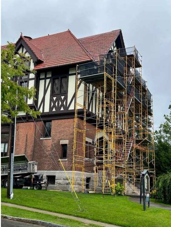
CHERRY AVE – NORTH FACE